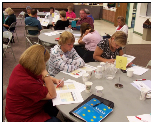
Participants taking a mini-assessment.