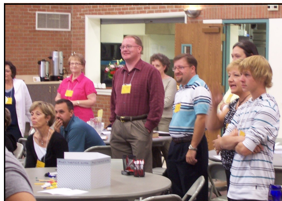
Table teams observe the final presentation of their collaboration projects.

“For this reason I remind you to rekindle the gift of God that is within you . . . .” 2 Timothy 1:6