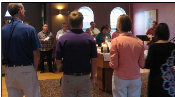
The group joined Classic KINDLE members for worship.