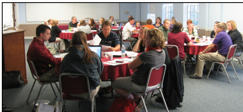
KINDLE for Recent Graduates participants discuss in their cluster groups.