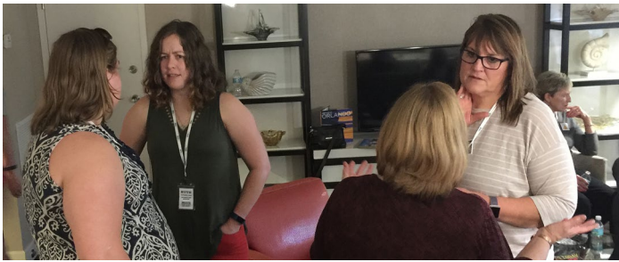
Enjoying fellowship and connecting with friends at the KINDLE Social.