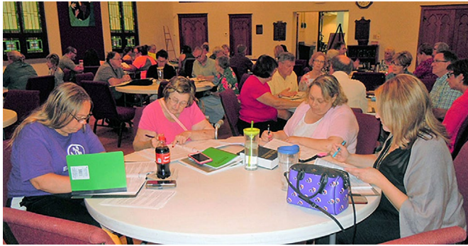
Christ-like Servant Leaders engage around God's Word