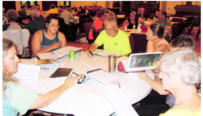
Christ-like Servant Leaders encourage each other as they develop their Growth Plans

Since I'm a musician, I've added opening and closing songs and hymns to the study that are thematic for the week. On the week we studied "Pray Unceasingly," the power of God's Spirit moved people to share some beautiful stories about how this study has encouraged them to be in prayer as much as possible. One dear soul was weeping as she described how her prayer and faith life have been impacted by this study, how each scripture assigned for reading has molded her heart and mind to a very deep relationship with Jesus.