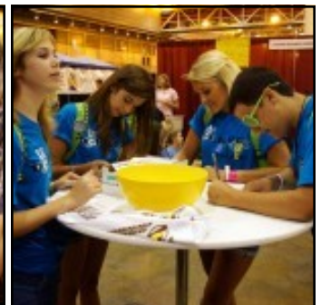
Young people writing a "postcard of appreciation."